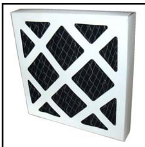
Carbon Pleated Panel

Custom sizes and filter designs available to suit individual requirements