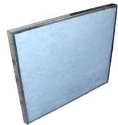
Carbon Biscuit Panel

A greater volume of carbon for more demanding applications such as the removal of toxic fumes and gases, commercial kitchen extract systems - available in standard and heavy-duty grades. Activated carbon is not designed to handle grease or moisture so it is important that all solid carbon filters are used in conjunction with suitable pre-filter(s) to protect and extend the life of the filter. Any build up of moisture or grease will cause the pores of the carbon to block, thus preventing adsorption.