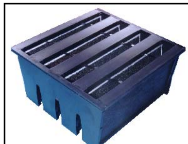
Rigid Carbon 'V' Cell